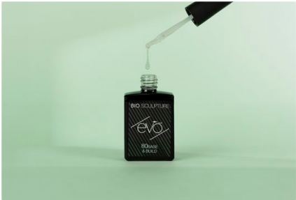
evō Gel Polish