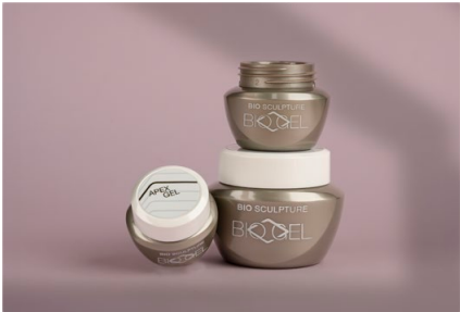
BIOGEL Original Nail Gel

Bio Sculpture’s professional products are available to nail technicians through brand training. As a training based system, Bio Sculpture endorses the highest standards globally and produces award-winning nail technicians worldwide. Bio Sculpture certified training courses are internationally recognised within the brand.