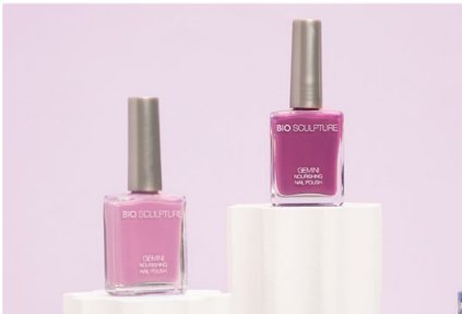
GEMINI Nourishing Nail Polish