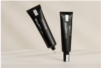
BI-OLYGEL UV Acrylic Gel