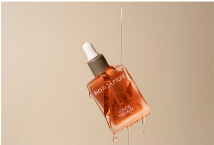
ETHOS Care for Natural Nails

Bio Sculpture’s home care range is pledged to skin and nail health. Indulge yourself in healthy and hydrating product options, tailored to suit your individual needs.