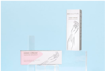
SPA Lush Spa Treatment Range