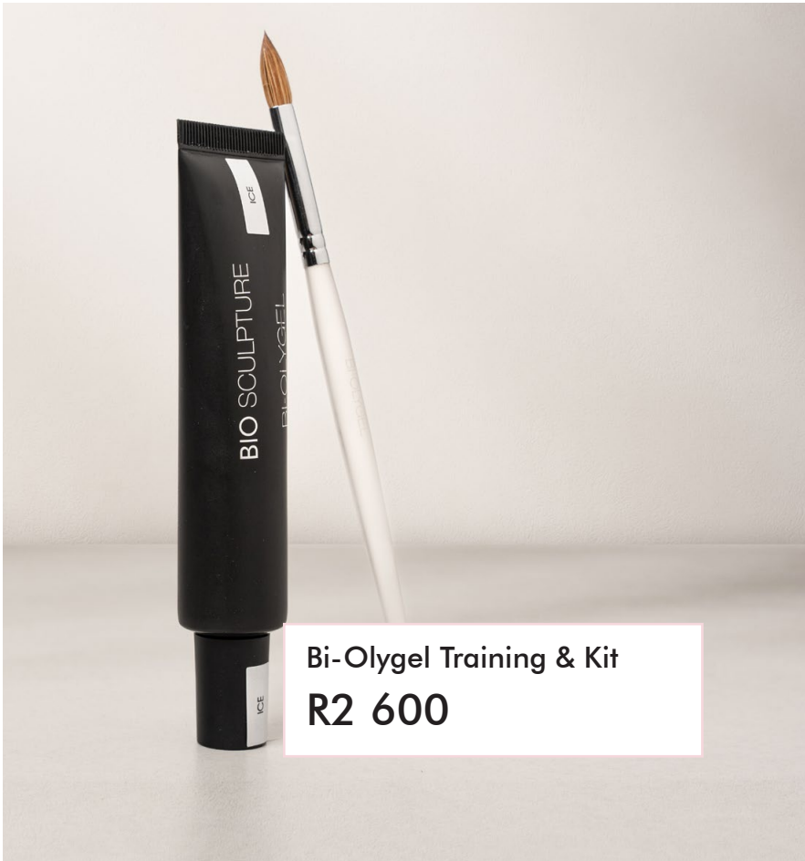
Bi-Olygel Training & Kit R2 600